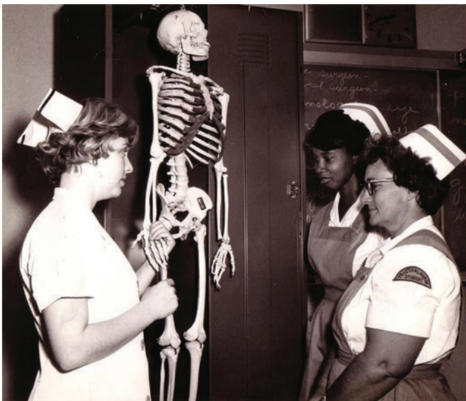
| Historic photo of NFC's Practical Nursing program from the 1960s.

In 2020, NFC's practical nursing graduates boasted